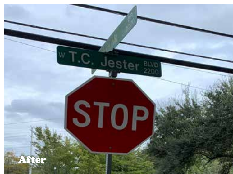
Before and after stop sign and post replacement. The new standard stop sign is much larger and more reflective than the original signs.